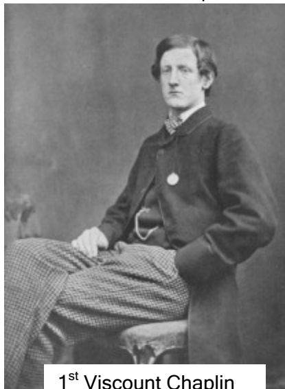
1 st Viscount Chaplin