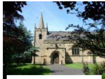
Long Benton Church