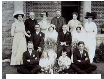
Double wedding Tiger Kloof 1913